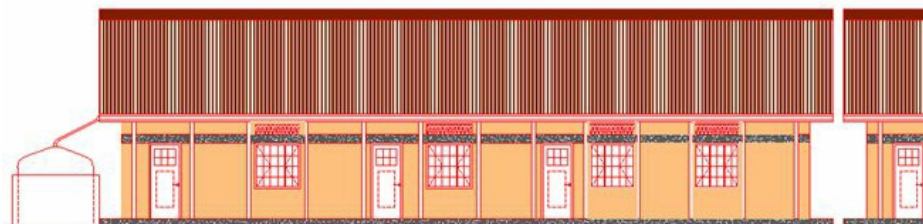
Part front plan view (just over one half)