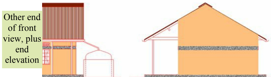
Other end of front view, plus end elevation