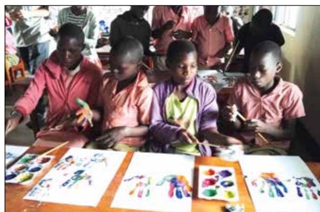
What fun! Enjoying art in our new classroom