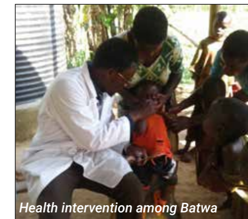
Health intervention among Batwa