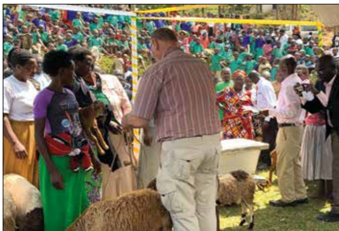
Presenting sheep and beehives