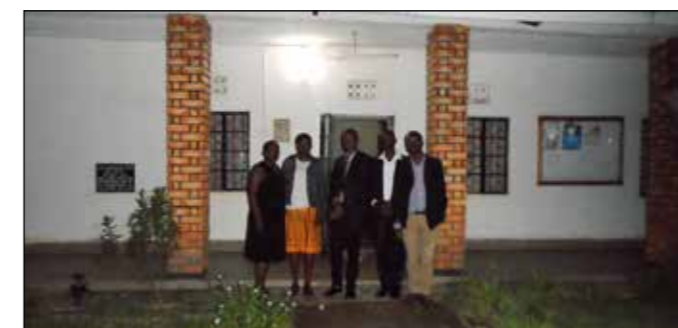
AICM staff outside their offices