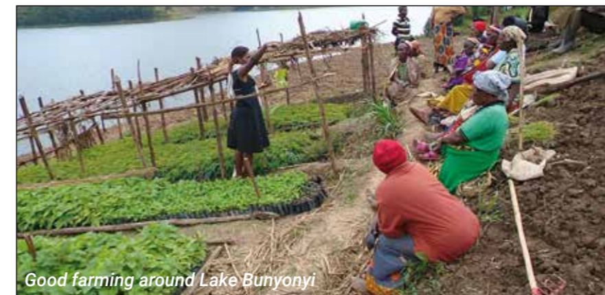
Good farming around Lake Bunyonyi

Throughout the year FAICM have also been supporting AICM in the daily provision of food at the Batwa Schools.