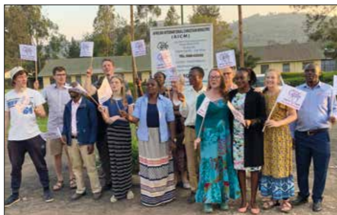
Valuable friendship and fellowship with AICM staff

We delivered sheep, beehives, savings boxes, crop sprayers and local language Bibles. The team also brought with them and distributed around 50 Good News Bibles to students.