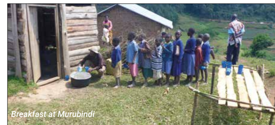
Breakfast at Murubindi