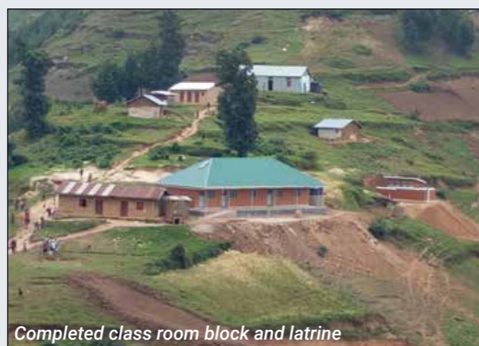
Completed class room block and latrine

new four stance latrine. In July when two trustees visited, this construction was underway, and by autumn these buildings were complete. Trustees are continuing to raise funds and hope that they will be able to ask the builder to complete two further class rooms and a staff room during 2020. Ideally the school needs a latrine and wash room for girls. It is our prayer that sufficient funds can be raised to enable this also. These facilities will have a profound impact on the lives of the whole community. We thank God for His provision.