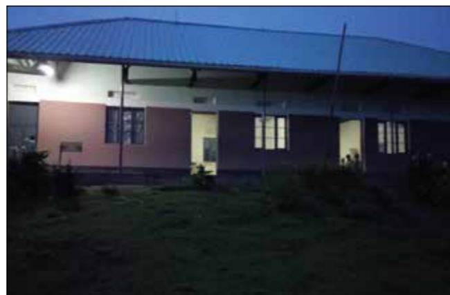
Solar brings light to Rwamahano Primary School