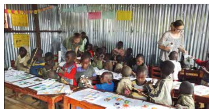
Murubindi children enjoying art