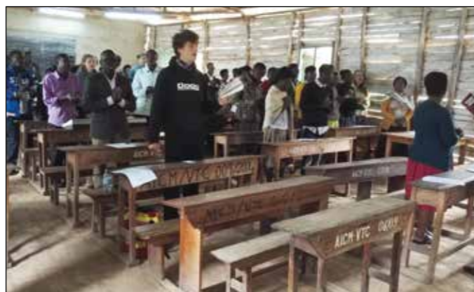
Morning bible teaching at the AICM College