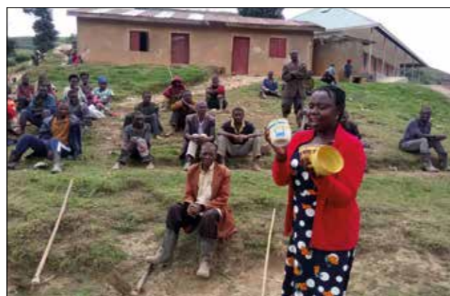
Batwa enjoy learning handicraft skills