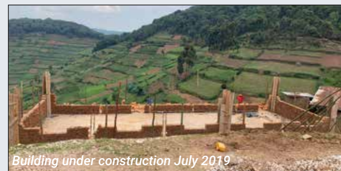
Building under construction July 2019