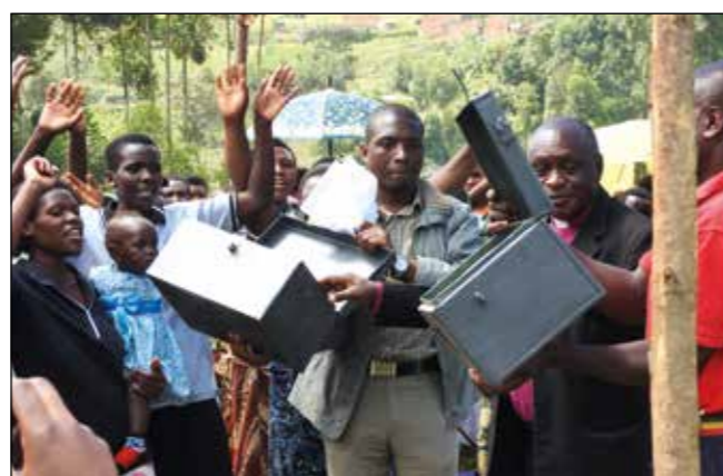
Encouraging saving and sharing